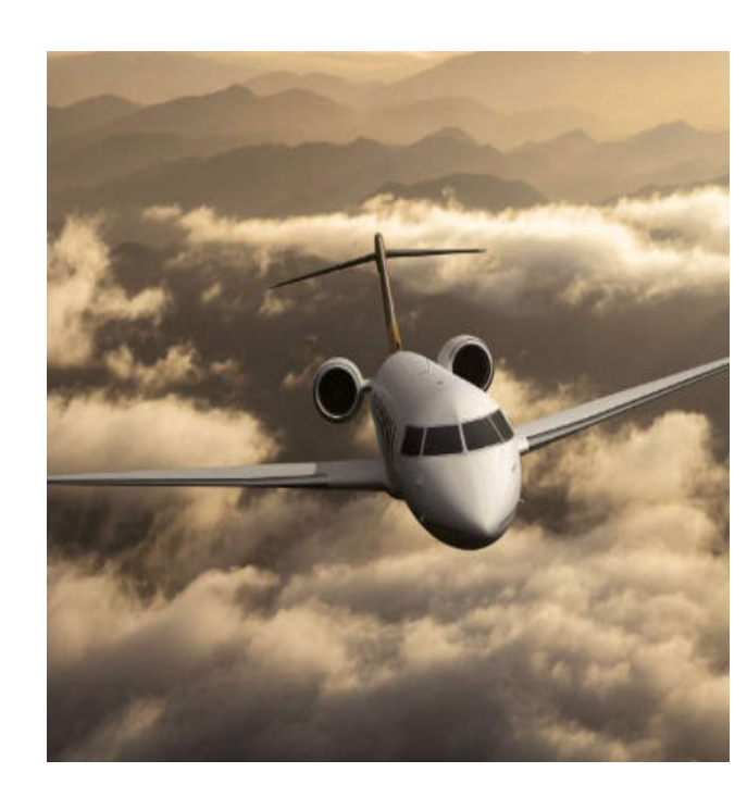
FIDUCIARY Risk Management